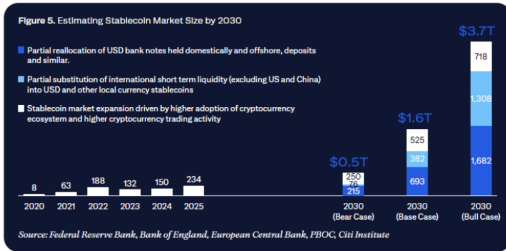
Chart 3: Estimates of future development of the global stablecoin market.